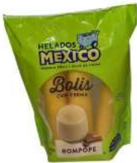
Helados Mexico Premium Rompopo Bolis Frozen Milk Bars

Even as COVID-related concerns subside over the coming years, increasing consumer trepidation over sustainability will impact the travel industry. In the US, 38% of consumer say COVID-19 concerns will prevent them from traveling in 2022