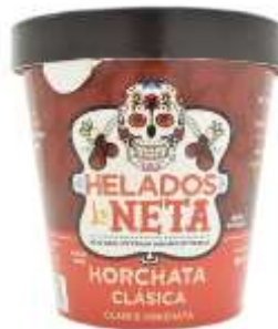
Helados La Neta Classic Horchata Ice Cream Described as real-deal ice cream inspired by Mexico.