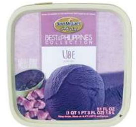
San Miguel Gold Label Best of the Philippines Collection Ube Purple Yam Mellorine Ice Cream

The plant-based product contains no dairy, artificial growth hormones, high fructose corn syrup, artificial flavors or synthetic colors