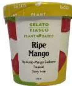
Gelato Fiasco Ripe Mango Alphonso Mango Sorbetto Tropical

The plant-based product contains no dairy, artificial growth hormones, high fructose corn syrup, artificial flavors or synthetic colors