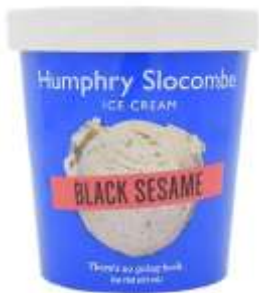
Humphry Slocombe Black Sesame Ice Cream

In North America, flavor remains a key ice cream attribute. Better-for-you options need to follow 'clean label' guidelines. In terms of more unusual flavor propositions, global retail launch activity shows that brands are incorporating Japanese flavors such as wasabi , seaweed , sesame or hojicha ; however, most of them currently appear in Asia with far fewer elsewhere.