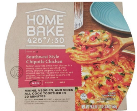
Home Bake 425° / :30 Streamlines cooking a main, veggie and side (US)

High-tech tools like artificial intelligence (AI) and augmented reality (AR) will help consumers find their ideal balance between occasions that can be put on autopilot, such as meal planning, shopping, cooking, or even eating, and the times when they have the drive to get creative in the kitchen.